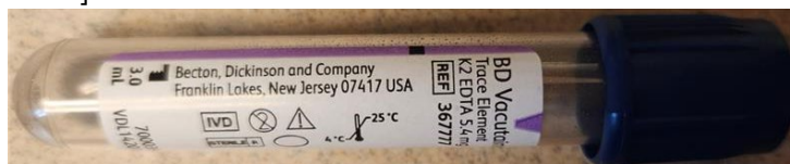
Tube Available through Supply Chain/Workday: ITM-1300126

Quick Guide: Royal Blue Tube | Updated: 3/2026 | Yellow highlights indicate changes.