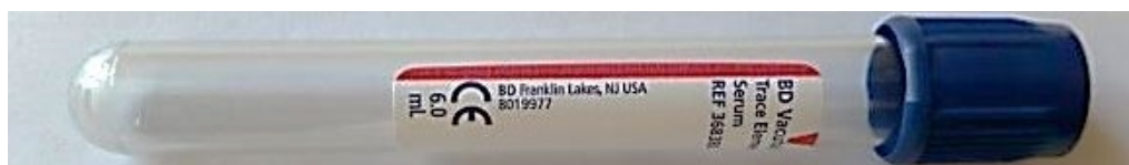
Tube Available through Supply Chain/Workday: ITM-1066808